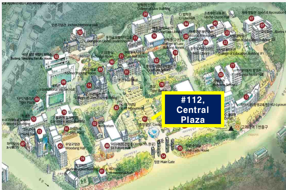
Humanities and Social Sciences Campus (#112, Central Plaza)